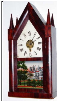
Terry Tandem Wind Steeple