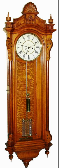
Seth Thomas Regulator #19