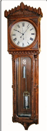
Seth Thomas Regulator #10