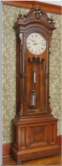
Seth Thomas Regulator #14

NEW & IMPROVED WEBSITE: WWW.ROSCHMITT.COM