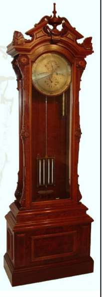
E. Howard & Co. Regulator #61