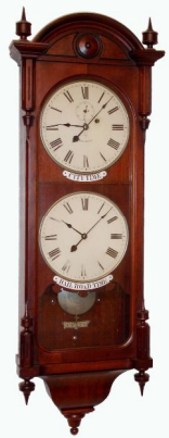
Seth Thomas #6 Double Time